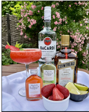
Susie Strawberry Daiquiri