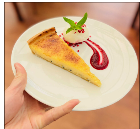
Alan's Lemon and Passion Fruit Tart

Father's Day is extremely popular, so please book early. Prices vary. £5 deposit required per person.