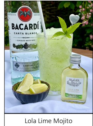
Lola Lime Mojito

Sip delicious cocktails in our beautiful summer garden, dressed to impress. Try our newly created summer cocktail menu as voted for by our Tasting panel. £15 per cocktail with canapés and FREE samples. £5 deposit required per person (redeemable against your purchases on the night). Limited spaces. Please note- the kitchen will be closed for diners on both evenings. Chips may be available.